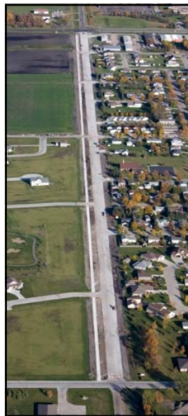
23rd St. NW in East Grand Forks