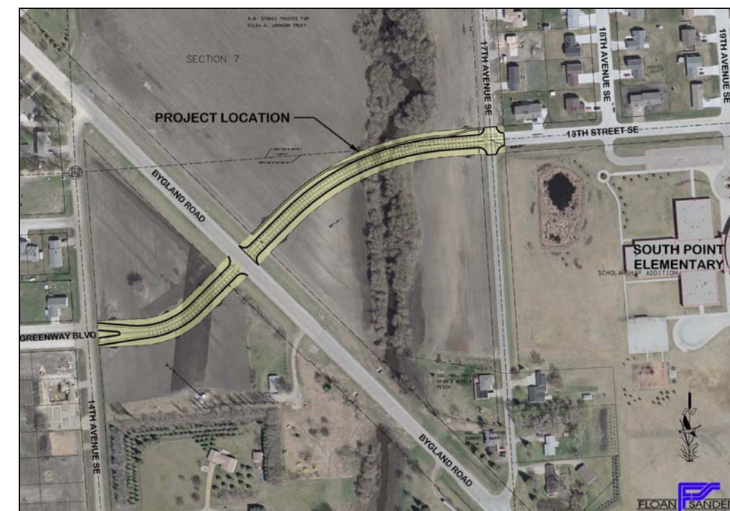
The aerial view shows the proposed extension to 13th Street as it crosses Bygland Road and the Hartsville Coulee.